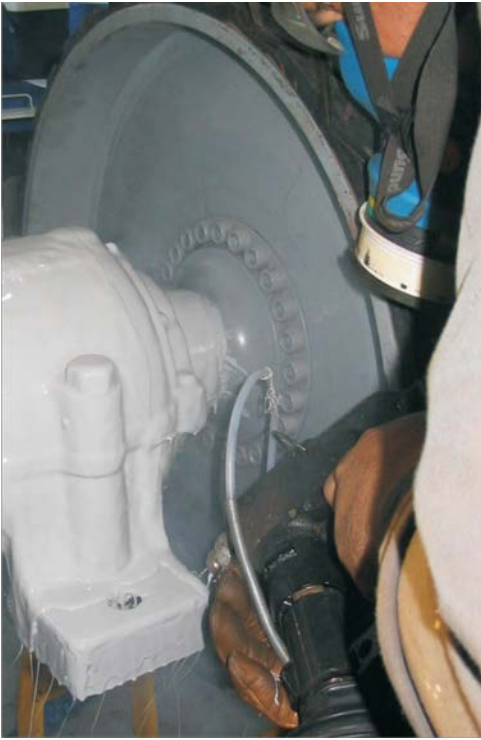
Above: Spraying Enviropeel on to a refurbished pulley housing.