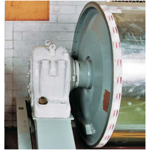
Above: An unprotected pulley housing - and a similar pulley after refurbishment. Below: With the Enviropeel removed from a pulley housing after use, it is clear how good the performance of the Enviropeel is. The roller in the background shows clear evidence of corrosion whereas the protected pulley is as good as new.