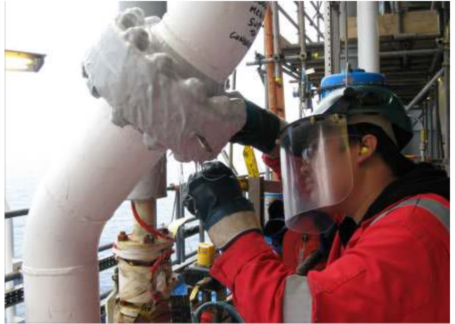
Application builds coats in succession, working from underneath, around the sides and finally above with two coats to provide maximum protection. The underside is the most difficult area to finish aesthetically but trimming between and after each coat ensures full protection. All trimmings and drips/spills are collected and recycled.